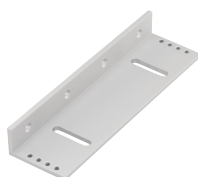
MLBK1200 L bracket