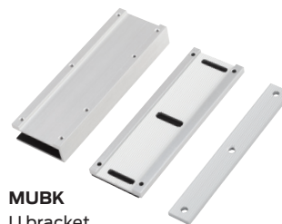
MUBK U bracket