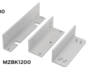
MZBK1200 Z bracket