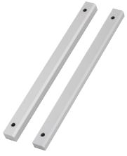
MFP50 and MFP63