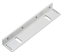
MLBK600 L bracket